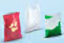
Bags and sachets