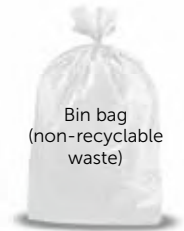
Bin bag (non-recyclable waste)